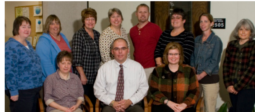
The Barron County Government Center features many WITC graduates.